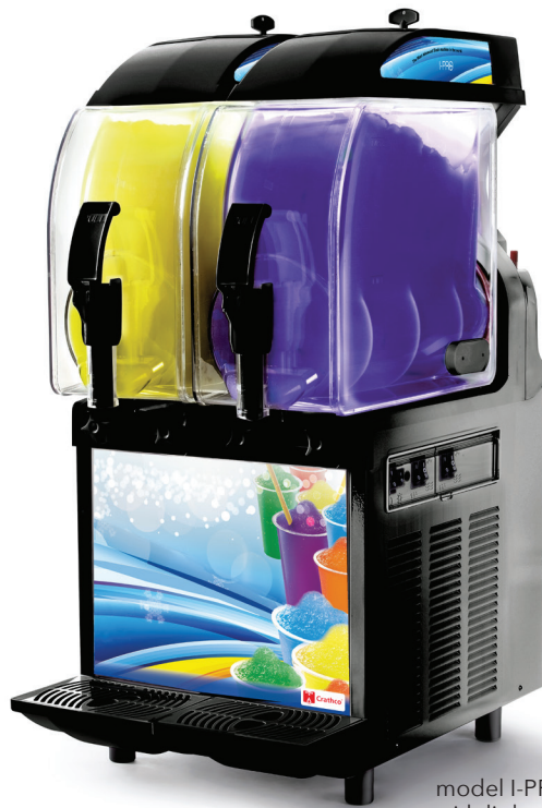
model I-PRO 2M with light panel